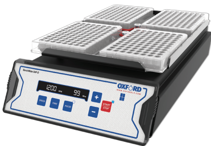
Digital Plate Shaker (S4P-D)