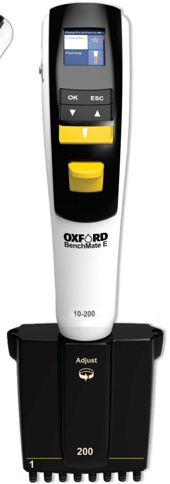
BenchMate® E Single and Multi Channel Electronic Pipettes