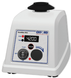
Digital Vortex Mixer (VM-D)