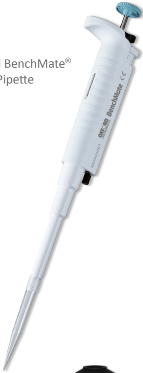
Original BenchMate® Pipette