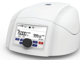
High Speed Microcentrifuge (C12V)